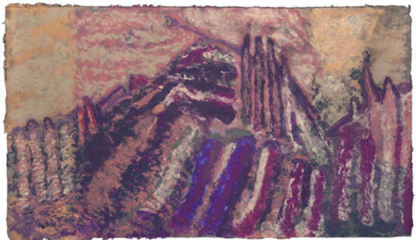
— Lynn Sures, Monserrat Purple 3, 34 in x 26 in, pulp painting, 2015