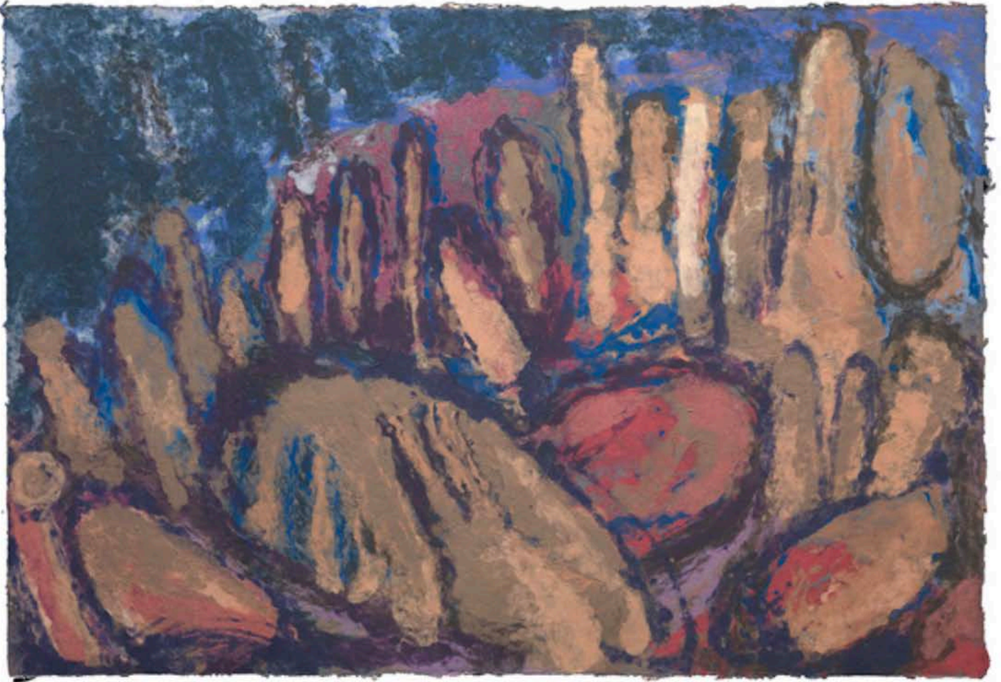
— Lynn Sures, Montserrat 4, pulp painting, 69 in x 48 in, 2015