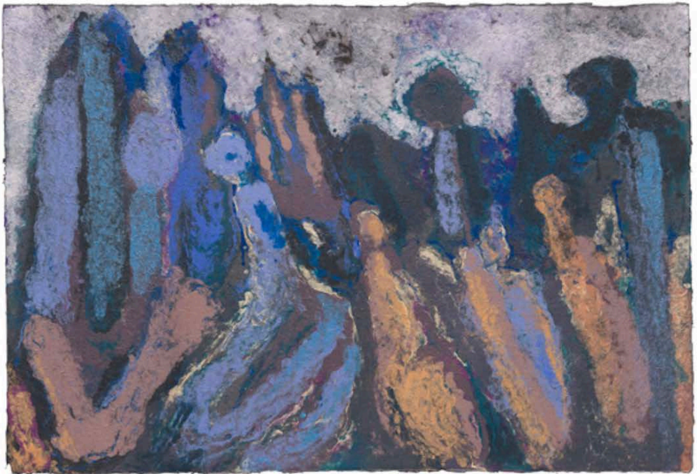
— Lynn Sures, Montserrat 2 , pulp painting, 69 in x 48 in, 2015

The pulp painting medium also has a undeniable material presence, which serves to echo the experience of being in the physical presence of mountains.