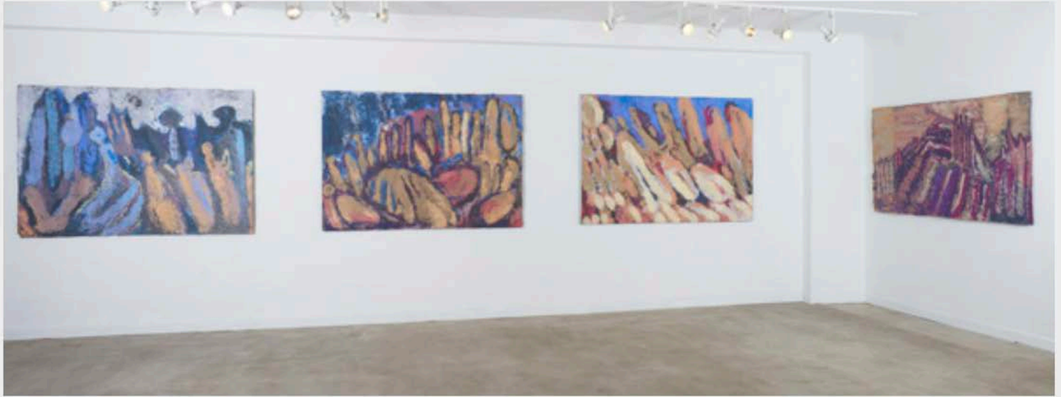
— Catalunya , Central Booking / Offline Gallery, Installation