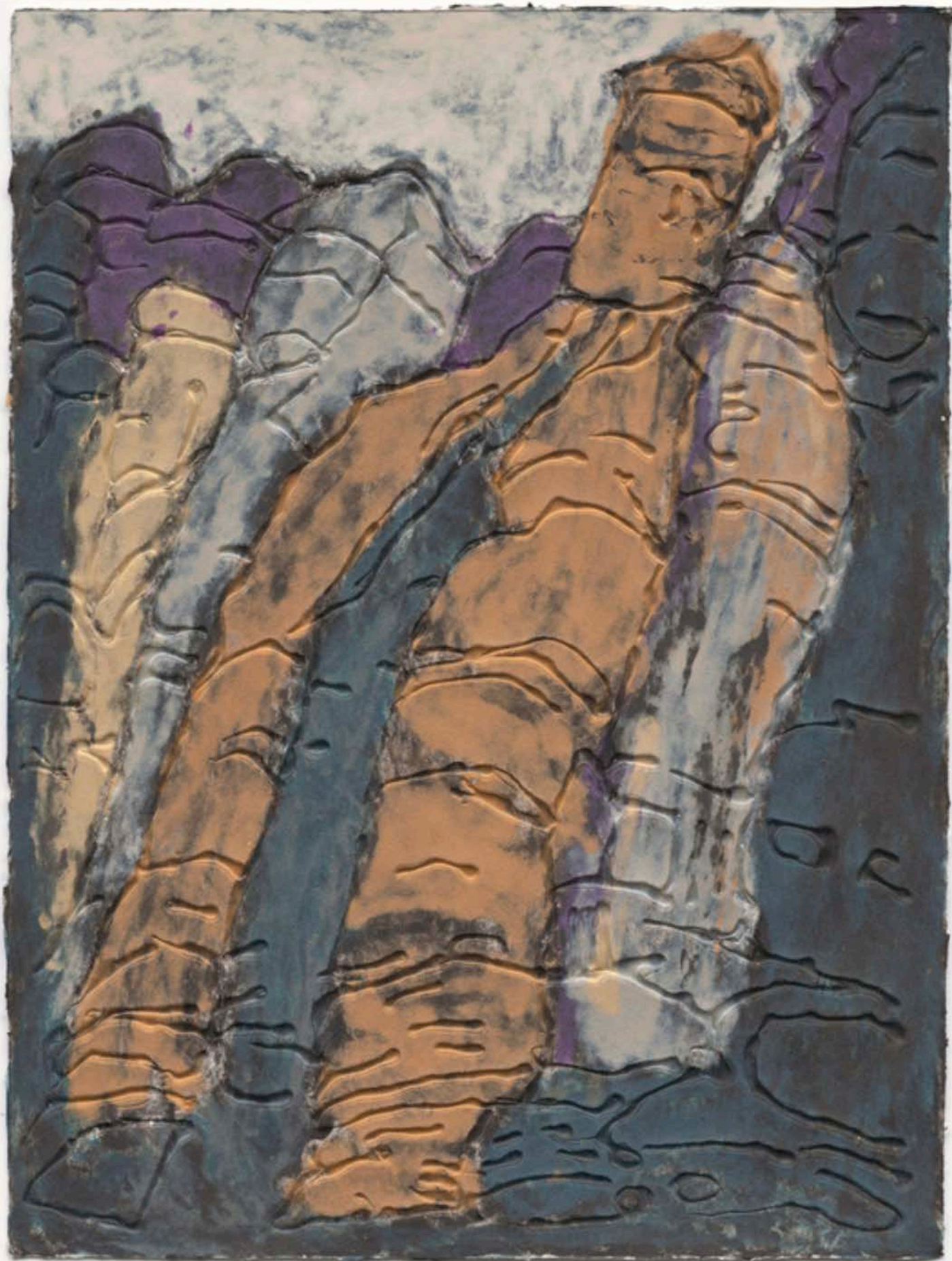
— Lynn Sures, Montserrat White 4 , pulp painting, 34 in x 26 in, 2015

Unique to these pulp paintings is a clear sense of drawing and defined, specific shapes, despite their abstractness.