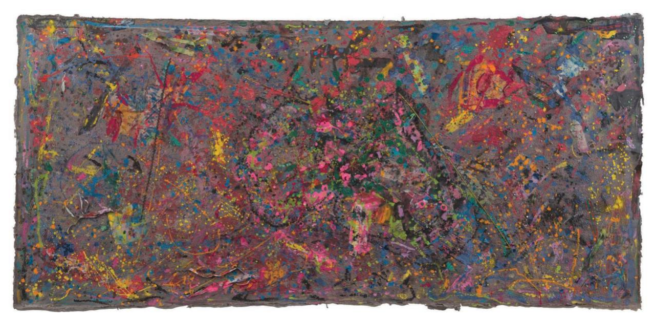
Pacita Abad, The Great Barrier Reef, 1991.

Radical Paper: Art and Invention with Colored Pulp Lynn Sures and Michelle Samour Imprint: The Legacy Press Price: $75.00 (https://www.thelegacypress.com/ or https://www.oakknoll.com/pages/books/141101) Pages: 440 Production details: hardcover; sewn; offset-printed; 342 full-color images; 12 x 9 in.; 5.8 lbs. ISBN: 9781940965260